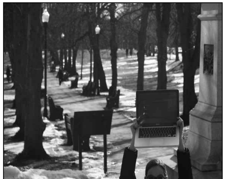
Soon you could be online in Victoria Park.

The councilors on the Community Planning and Economic Development committee were not available to comment on the present status of the wireless initiative. City council reviewed a report outlining the project last week.